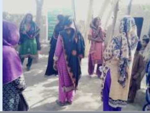
COVID-19 social-distancing sessions with communities at district Khairpur