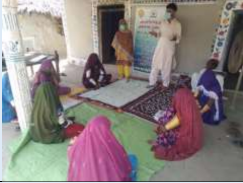
COVID-19 awareness campaigns at District Mirpurkhas