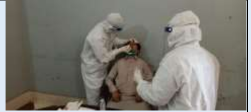
COVID-19 Testing process of SRSO Staff was completed at District Khairpur