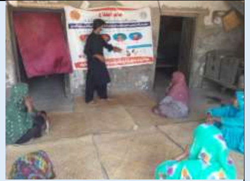
COVID-19 awareness sessions conducted at Shikarpur