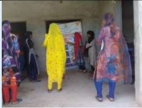
Covid-19 awareness session conducted by SMT Badin